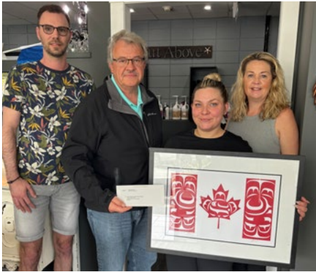
Looking forward to another great Canada Day in Campbell River.