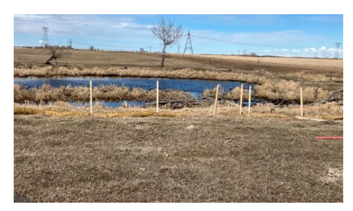
Wetland protection measures being put in place prior to cable crossing boring nearby and cable ploughing.