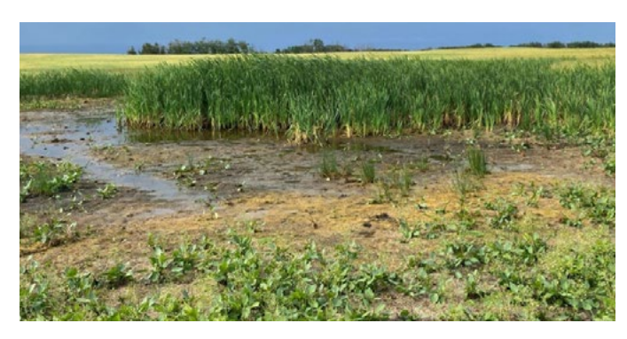
Photos of seasonal graminoid marshes (Class 3 wetland) taken during a wetland field survey. These photos show they may appear during wet conditions. Photo below shows how they may appear within a cultivated field during dry conditions

Capital Power has used wetland mapping data and various field studies to guide Project design and reduce environmental impacts. The Project design followed Alberta's Wetland Mitigation Hierarchy (GOA, 2018) of 1. Avoid, 2. Minimize and 3. Replace.