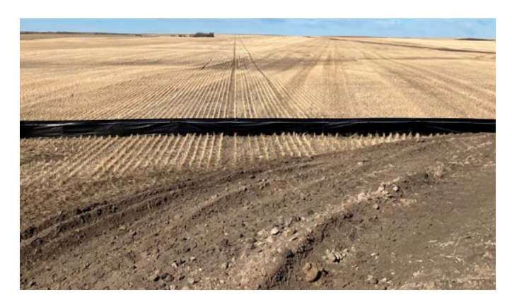
Erosion control measures along edge of a turbine pad under construction

will not be reclaimed until after Project decommissioning. This includes wind turbine generators, turbine pad sites, and access roads, substation operation/maintenance building, and the meteorological tower. Permanently impacted wetlands are subject to replacement fees as per the Alberta Wetland Mitigation Directive. (GOA 2018).